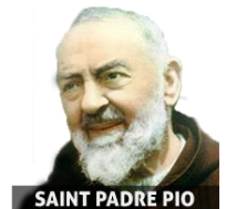
SAINT PADRE PIO

The San Padre Pio prayer group invite all to participate in the San Pio Triduum starting September 18 th and ending September 20 th . The celebration will end with a candlelight procession, distribution of bread and light refreshments in the parish hall.