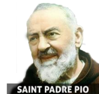
SAINT PADRE PIO

Devozione di Padre Pio con la celebrazione della Santa Messa: il ottobre (mercoledì) alle 7:00 p.m.