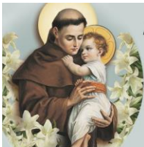
Saint Anthony of Padua (1195-1231)

Celebration to continue into the evening with entertainment and great food!